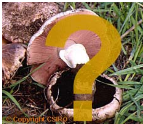
The humble Field Mushroom ( Agaricus ) is now seen less and less

In woodland regions, as elsewhere, the best known fungi are generally edible types with conspicuous fruit bodies such as big mushrooms in pastures. General declining levels of field mushrooms ( Agaricus species) in Australian pastures in recent years may be attributable to compounded factors such as fertilizers, soil disturbance, and loss of organic matter.