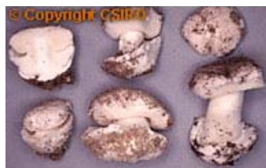
Torrendia grandis - A rare fungus (only known from several locations, all near Kellerberrin, Western Australia)

Many Australian fungi are unique (endemic) to this continent. For example, more than 95% of Australian truffle species and 35% of truffle genera, and more than 70% of Australian mycorrhizal fungi may be endemic. The uniqueness and diversity of many Australian larger fungi may have been brought about by their co-evolution with Australia's unique plants during long periods of geographic isolation. Because there are so many undiscovered and unique fungi, it is not surprising that new fungi are regularly being discovered in Australia. Many yet await discovery.