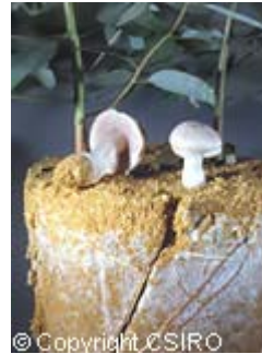
Pot seedling showing mycorrhiza amongst roots and fruiting body

Fungi have symbiotic (mutually beneficial) partnerships with many plants. Some fungal networks act like an extra root system taking up, transforming and transporting nutrients from soil and delivering them to plant roots. The so-called mycorrhiza "fungus-root" systems are often superior to roots alone. The fungi can capture nutrients in the soil far distant from roots. The fungi benefit as the plants supply sugars to them. Many of the world's plants are partnered by mycorrhizal fungi in natural ecosystems. In Australia hundreds of different native mycorrhizal fungi partner native trees, shrubs and herbs such as eucalypts, sheoaks, wattles, and poison peas. (also see the CSIRO Mycorrhiza website for more detail)