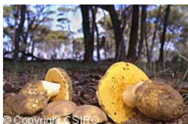
Boletes in Eucalypt woodland

More Australian fungi have been studied in high rainfall forest areas than in woodlands. Recent studies have revealed a previously underestimated diversity of fungi in Australian woodlands. For example surveys in several remnant woodland vegetation patches near Kelleberrin in the Western Australian wheatbelt during three 'fruiting seasons' yielded 51 genera of native fungi. (see the 2002 report "Using native soil fungi to improve sustainability of woodland revegetation" and others in the Additional Resources Section ) Some native woodland fungi are currently only known from a few remnant woodland patches (such as Torrendia grandis ).