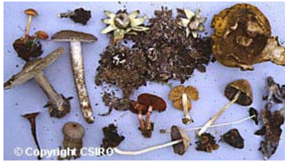
Some of the large fungal diversity in the tuart forest, south-west of Western Australia

The biodiversity of fungi remains poorly known in Australia because less attention has been given to them than to the study of plants, and because the fruiting bodies of fungi are ephemeral structures appearing at irregular and unpredictable intervals. Sampling of fungi at any one time will reveal only a fraction of the fungi present at any location.